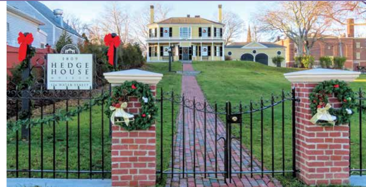
Christmas decorations on the new fence at the Hedge House.